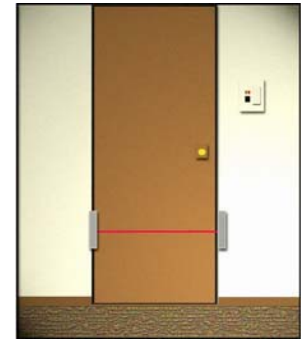
12 " SINGLE BEAM TAILGATE

When a person walks through the doorway in the exit direction, no alarm is generated.