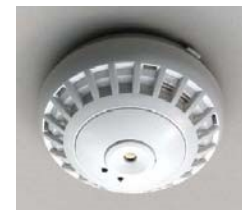
Iris Overhead Sensor