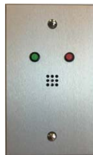
System Status Display