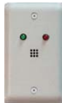
System Status Display